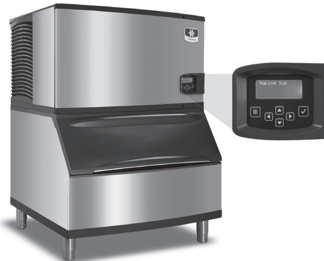
Indigo Series i-300 Ice Machine on B-170 Bin

Designed for operators who know that ice is critical to their business, the Indigo™ Series ice machine's preventative diagnostics continually monitor itself for reliable ice production. Improvements in cleanability and programmability make your ice machine easy to own and less expensive to operate.