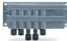
Servend's Flexible Beverage Manifold