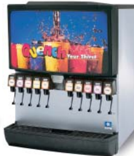
MD-250-10 PB F424