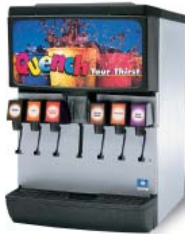
MD-150-6PL F 424