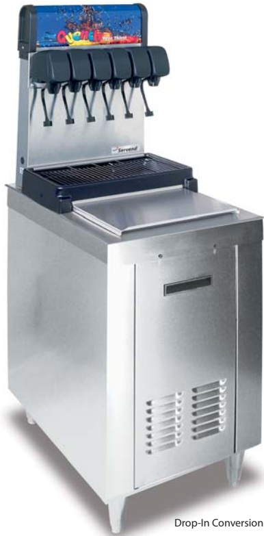
Drop-In Conversion Stand

Drop-In Conversion Stands, Cabinet Stands, Ictainer Leg Sets