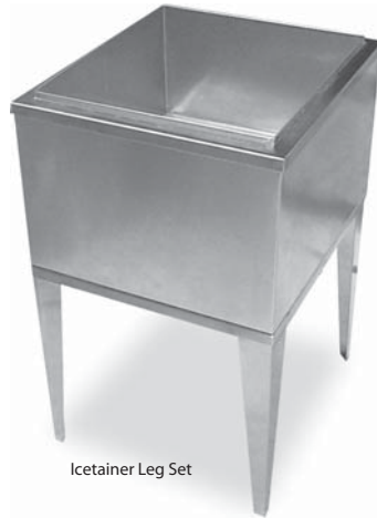
Ictainer Leg Set