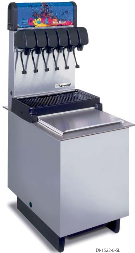
DI-1522-6-SL Shown with 464GP Valves