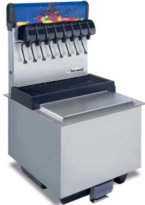
DI-2323-8-SL Shown with 464GP Valves